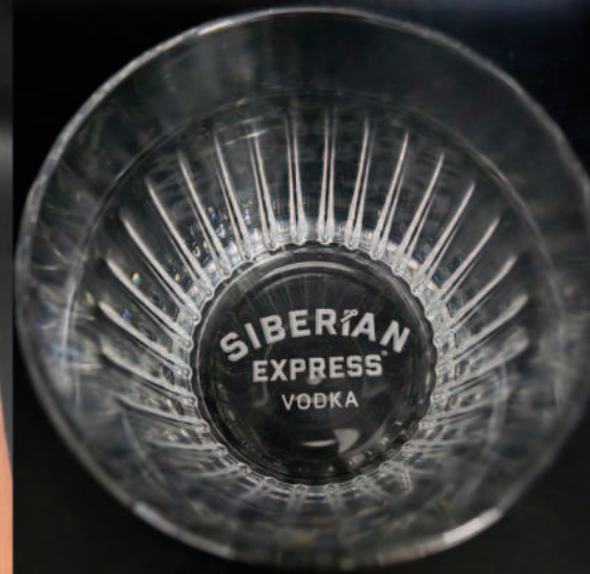
APPLICATION OF LOGOS on glasses and goblets